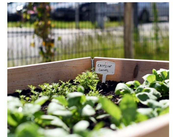
› Community garden at AAU Campus Aalborg East

In the green areas of AAU, the new Community Gardens project was established to provide staff and students the opportunity to have small urban gardens on the AAU Campus. Staff and students can rent plant boxes to grow their own herbs, flowers and trees.