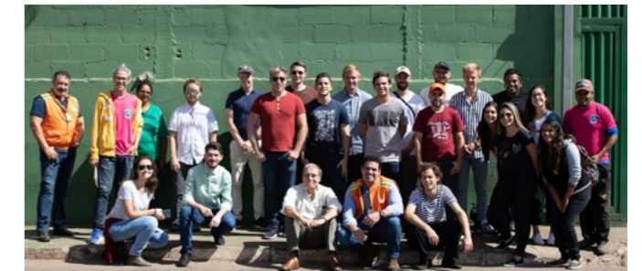
> Project team in Brasilia

One of the specific problems that students from different universities have partnered on solving is located in Brazil. When the world's second largest dumpsite just outside Brasilia was closed and replaced by a modern recycling centre, it was a huge step forward for the city of millions in terms of waste disposal. However, for the nearly 1000 children and adults who survived by trash-picking, it was a disastrous loss of livelihood. Students participate in different projects to support the locals who lost their livelihood to the new recycling centre. This includes a mobile education platform and IoT waste management .