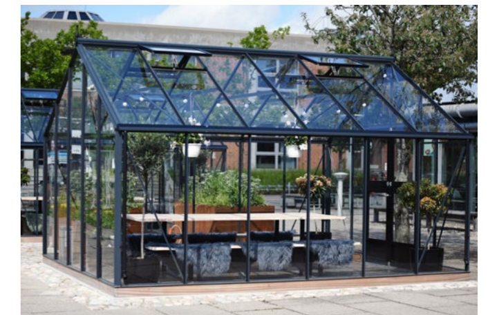
› Greenhouse at AAU campus

In addition, new greenhouses with study areas have been established at campus to provide students with study areas in the new wilder nature of AAU campus.