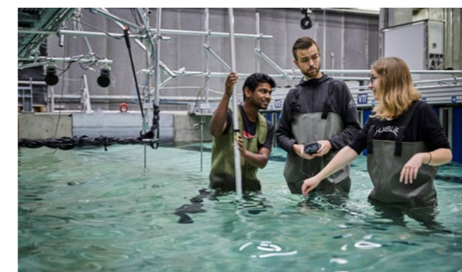
› Water laboratory at AAU

As the second lowest lying country in Europe, Denmark will undeniably be affected by the changing climate. In particular, the instability associated with excessive water and unpredictable weather patterns poses a significant threat. As water has no regard for municipal boundaries, the holistic solutions required to deal with this issue must be interdisciplinary and cross-organisational. One of the goals of the Coast2Coast Climate Challenge is thus to build municipal authorities' capacity and enable them to develop and implement climate adaptation plans in their respective areas. The project covers a large territorial area and involves 15 municipalities in the Central Denmark Region and 3 in the North Denmark Region. From AAU, Birgitte Hoffmann, Associate Professor in the Department of Planning, is a member of the scientific committee.